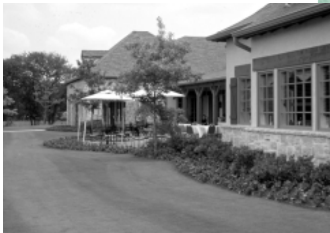
Begin mowing as soon as the bermudagrass begins to turn green in the spring.

If you suspect that nematodes are in your lawn, send a soil sample to the Plant Disease Diagnostic Laboratory for testing. Contact your county Extension agent for more information.