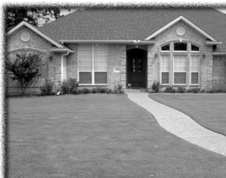
The best form of weed control is a healthy, dense, actively growing lawn.

Bermudagrass lawns should experience no detrimental insect activity in the winter.