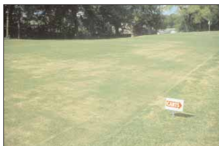
Figure 1. Golf course fairway damaged by white grubs.

White grubs, sometimes referred to as grubworms, injure turf by feeding on roots and other underground plant parts. Damaged areas within lawns lose vigor and turn brown (Figure 1). Severely damaged turf can be lifted by hand or rolled up from the ground like a carpet.