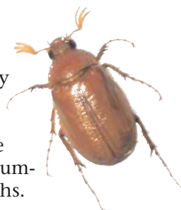
Figure 2. Adult white grubs, often called May or June beetles, are commonly attracted to lights at night.

The most important turfgrass-infesting white grubs in Texas are the June beetle, Phyllophaga crinita (Figure 2), and the southern masked chafer, Cyclocephala lurida . Warm season grasses like bermudagrass, zoysiagrass, St. Augustinegrass and buffalograss are attacked readily by both types of white grubs, with most lawn damage occurring during summer and fall months.